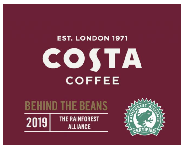
Figure 3 - Costa Coffee Rainforest Alliance Certification [31]

Costa Coffee, the popular multinational coffee brand as shown in Figure 3 - Costa Coffee Rainforest Alliance Certification [31]. Since the rainforest alliance involves growing crops under natural conditions, it promotes healthy products without the use of chemicals, which is recommended for sustainable health. Rainforest alliance also ensures that the soils are not acidic since it encourages using organic materials to add fertility to the crops grown; for instance, if it is tea, let humans and dead animals in the soil contribute to that. If any additions are required, a farmer could as well used organic manure, which contributes to healthy tea produce.