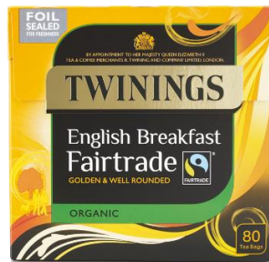
Figure 1- Twinings Fairtrade Tea [28]

Fairtrade can similarly embrace corporate social responsibility hence where it can have a positive impact on society. The food industries can explore corporate social responsibility as they fulfill the agenda of giving back to the society of both their employees and the farmer[27]. Through CSR, the food industry will as well enlighten the society on the importance of sustainable consumption, which ensures resources are not depleted. This will also give the food industry a chance to market their products to the consumers and probably explain why labeled products may tend to have slightly higher prices. The food industry can enlighten society on the health implications of foods that do not promote sustainable consumption, which could result in increased mortality rates. Increased mortality rates are against achieving sustainable development and poor health.